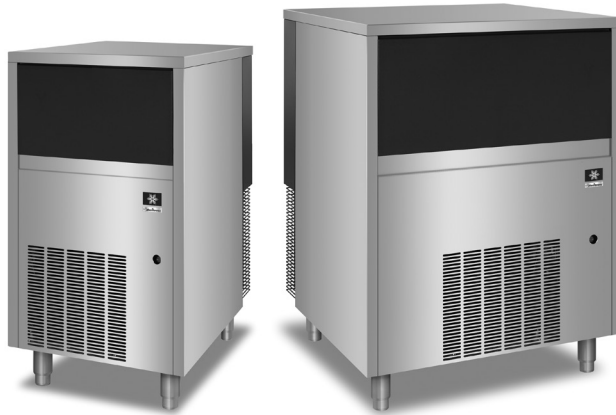
Model RNS-0244A Nugget Ice Machine