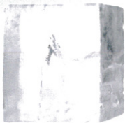
Full Cube 1-1/4" x 1-1/4" x 1-1/4"

Fill 'em up. Where on-demand ice and water are needed, the KOLD-DRAFT AKD125 Automatic Ice Cube and Water Dispenser is the solution. Ideal for hospitals, training facilities, clinics, nursing homes, hotels, resorts, and schools, the AKD125 features one-hand, pushbutton dispensing for ease of operation when filling containers and ice buckets. For cool, clear ice water, an optional water valve and tapered ice spout facilitate glass filling.