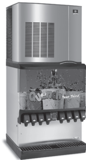
RN-1408A Nugget Ice Machine on Servend SV-250 Dispenser