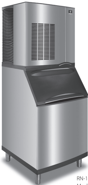
RN-1408A Nugget Ice Machine on B-570 Bin