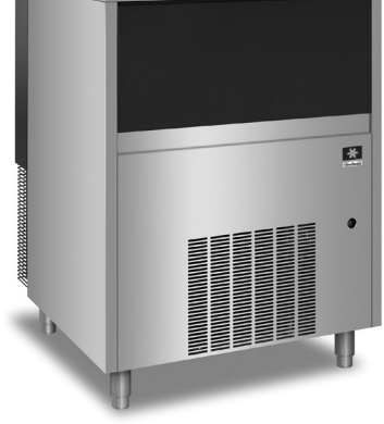
Model RNS-0244A Nugget Ice Machine